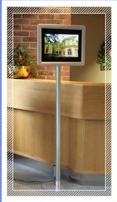
Wall Mounted Free Standing