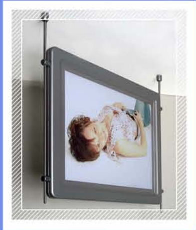
Suspended Ceiling Hung